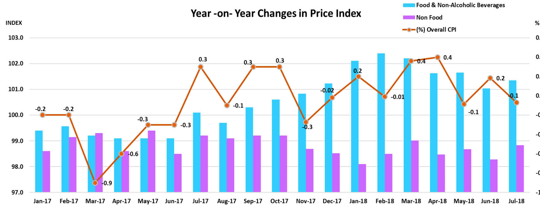
(%) Changes Year-on-Year, Month-on-Month and Period-on-Period For July 2018